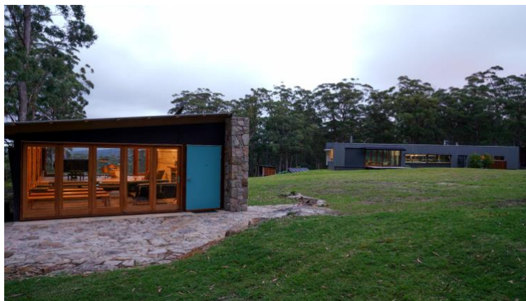
“Lagavulin” the chamber music space.