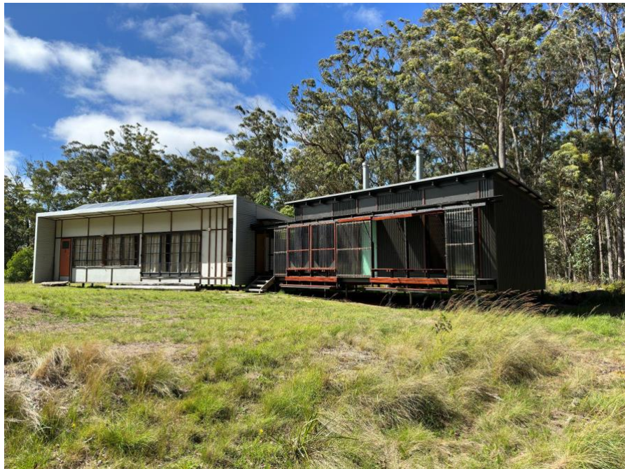
The Studio (left) and 'Archie Rose' (the residency accommodation pod, right)

We welcome enthusiastic, curious, and adventurous people with a passion for Place-inspired investigation into making, composing, and/or studying in the unique environment that our property and its facilities provides.