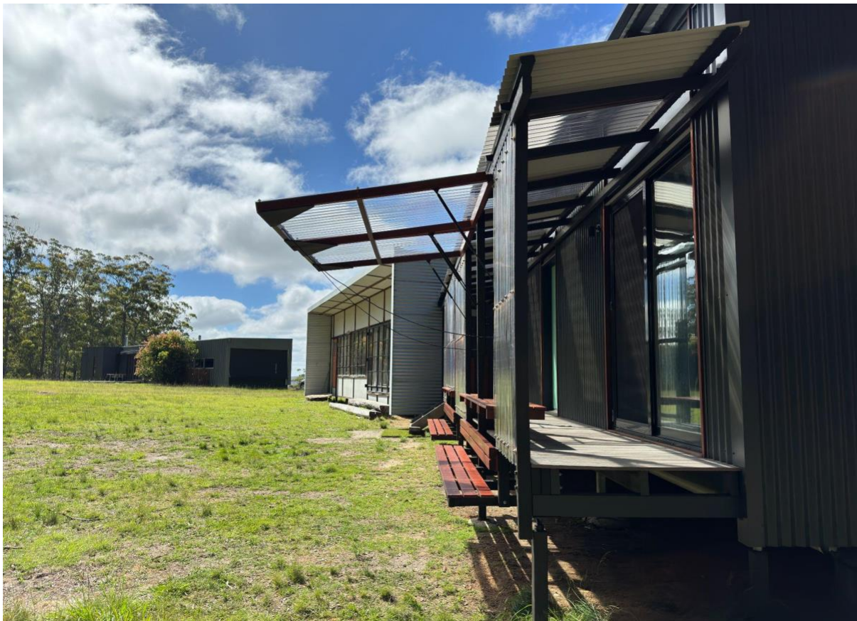
Accommodation pod (right) and studio in relation to the main house.